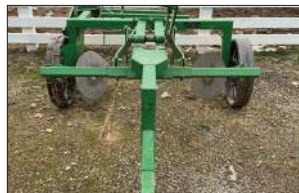
EZ Trail Plastic Lifter

Directions: Take Rt.32 to Red Hollow Rd, 700ft. turn right on to Adams Rd. for .8 mi to auction on right.