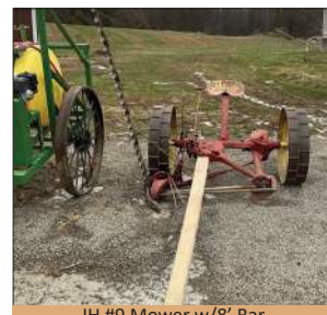
IH #9 Mower w/8' Bar