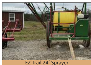
EZ Trail 24' Sprayer