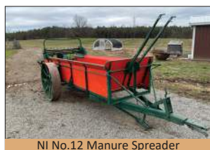
NI No.12 Manure Spreader