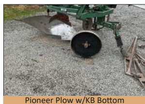
Pioneer Plow w/KB Bottom