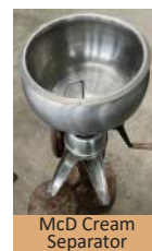
McD Cream Separator