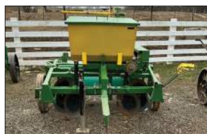
EZ Trail Plastic Layer