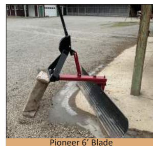
Pioneer 6' Blade