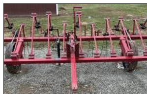
Hillsboro #12 Tedder